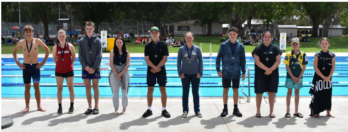
Age Group Champions L-R